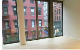
All residences feature floor-to-ceiling glass sliding doors.