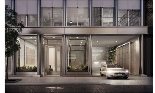
The building will offer a residential lobby and retail space at its base.

The building's base will feature retail space, with available frontage spanning 71.25 feet on Broome Street and 114 feet on Crosby. The base will also host a 24-hour attended lobby, complete with a terrarium art installation by Paula Hayes. An underground ten-car parking garage will feature 99-year parking leases priced at a whopping $1 million dollars, with an average price per square foot more expensive than that of the residences themselves. More services at the building will include private storage, cold storage, and a state-of-the-art car elevator.