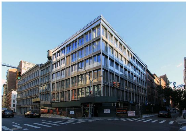
42 Crosby's nearly completed exterior.

BY KATY CORNELL TODAY, SEPTEMBER 21, 2016