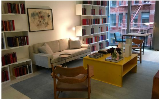
The residence's library can be converted into a third bedroom.