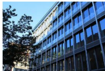
Looking up at the Crosby Street facade

Designed to reflect the history and creativity of the neighborhood, the corner building features a lovely cobblerstone entry and an exterior distinguished by stainless steel, brushed aluminum, and metal mesh. Inside, are nine 3-bedroom residences topped by one 5-bedroom penthouse duplex. There are currently five residences for sale, ranging from $8.4 million for a 2,798-square-foot 3-bedroom residence to $25 million for the 5,852-square-foot penthouse.